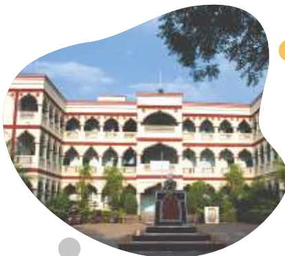
SHREE SARASWATI VIDYALAYA, RAMESHWAR, LATUR