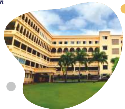
MIMER, TELEGAON DABHADE