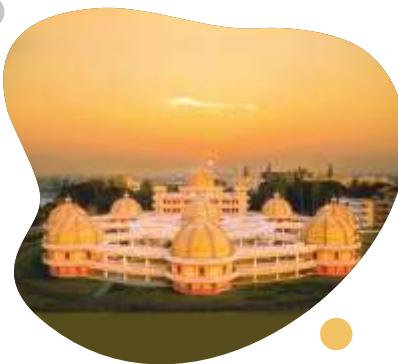
SANGEET KALA ACADEMY